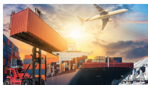
Import & Export