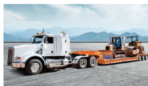
Flat Bed & Over-Dimensional