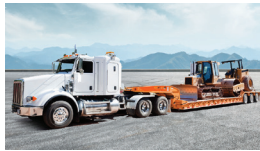
Flat Bed & Over-Size