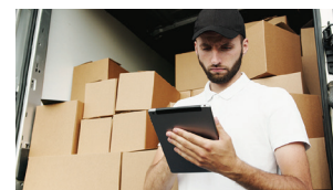
Same Day & Next Day