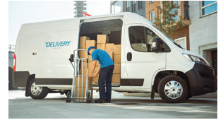
Small Package & Parcel