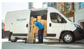
Small Package & Parcel